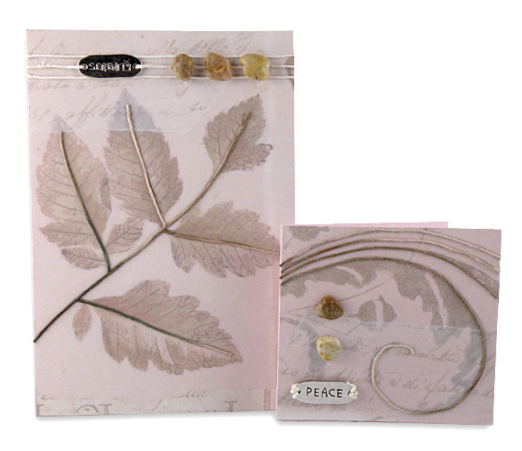
Gift Design by Gina Tepper